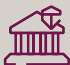
DEFENCE AND GOVERNMENT SERVICES