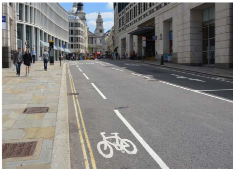
Lanes <4,000 veh/day