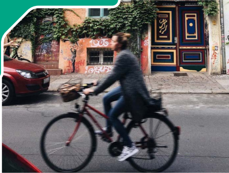
On-road <2,000 veh/day